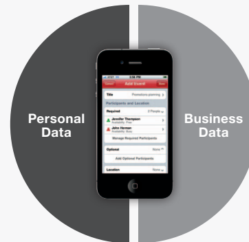
Good's secure container separates company and personal information.